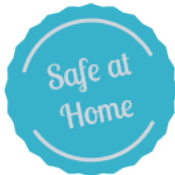
Safe at Home

Safe at Home filters through the mail, sorts it, and processes it in our Safe at Home office.